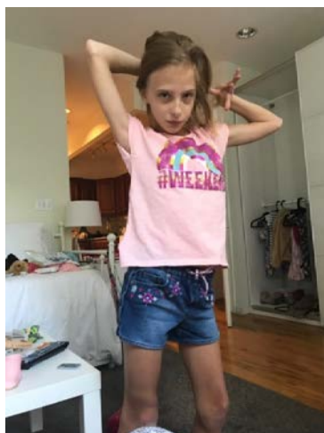
Attempting to tie her hair in a ponytail using both hands