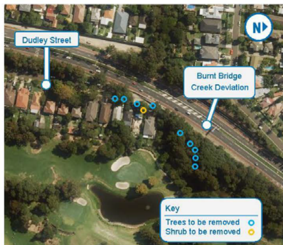
Location of trees and shrub to be removed.

Our night shift hours will be between 9pm and 5am from Sunday to Friday. To complete the work, we will need to work up to 6 nights per month. We will not work public holidays.