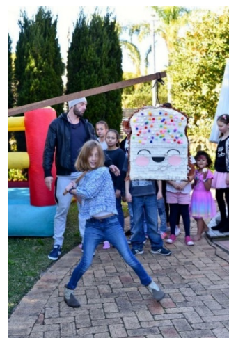
At a birthday party recently – hitting the piñata