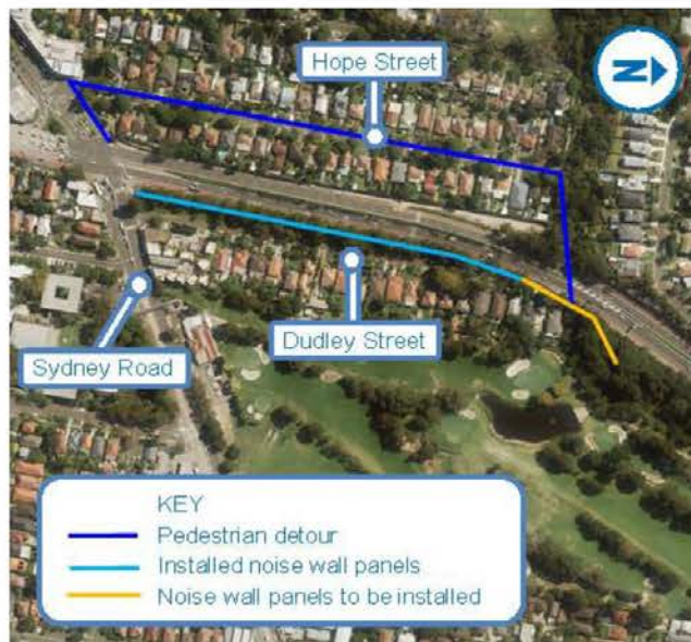
Location of pedestrian detour.

Thank you for your patience during this important work.